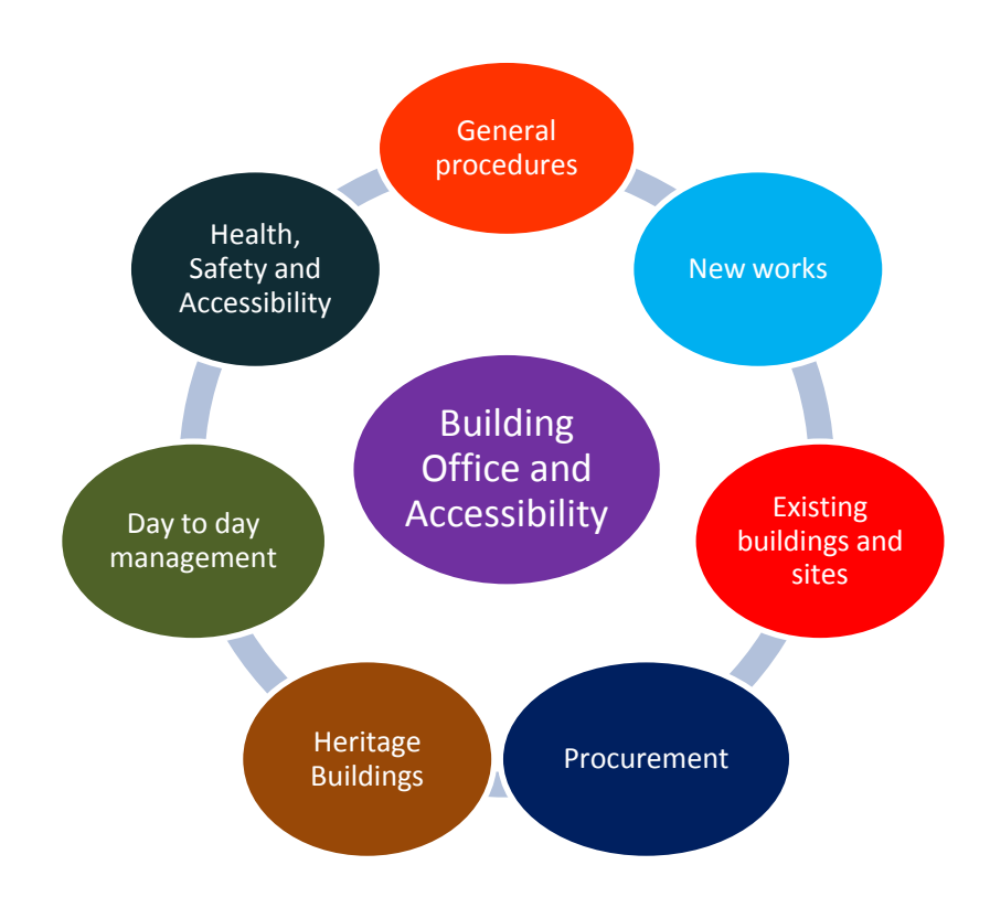
Figure 1 Key elements to make the built environment accessible.

It was clear from the outset of the service review carried out by O'Herlihy Access Consultancy in early 2012 that DIT and the Buildings Office are very committed to improving and making their services and buildings more accessible to all. Prior to the services review of the built environment, DIT had taken a number of previous