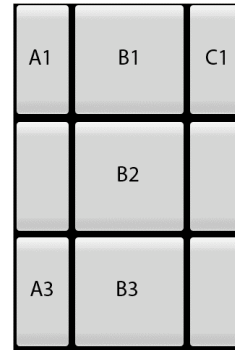
FIGURE 2. The button layout on the touch screen. B1, B2 and B3 are used to select the scanning distance, A1 selects guiding mode, C1 scanning mode, and A3 the POI to be guided to.

noticeable if POIs are very close in angle and falling into the same sector range (see points A and B in figure 1), and disturb the user experience. We do, as yet, not employ any signal filtering strategy, and although we want to minimize processor usage, some filtering strategy might need to be adopted in a later stage.