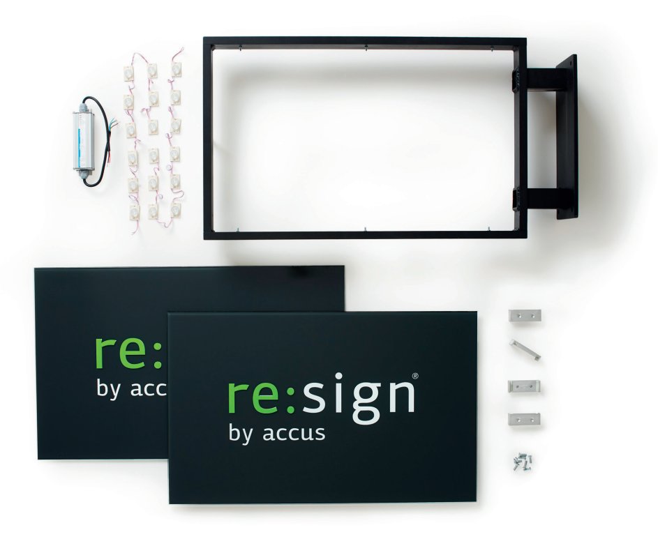
Figure 5: Exploded view of a modular sign

The contingencies of translation, enrollment, and action net building explain Re:Signs' difficulties at enrolling customers in the more ambitious circular solutions. To address these difficulties Accus' CEO contemplates making it more explicit that Re:Sign can serve different levels of circular ambitions. Investigating ways of enrolling a metric that quantifies products' circularity (e.g., Linder, Sarasini, & van Loon, 2017; Tecchio, McAlister, Mathieux, & Ardente, 2017), he would like to develop a way to signal that the different circular options offered by Accus stand for different degrees of circularity.