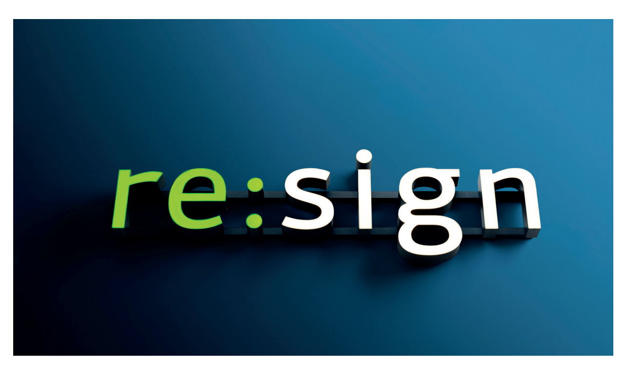
Figure 4: Re:Sign logo

As we write these lines, Re:Sign seems more successful at making Accus' regular products more sustainable, than at supporting the development of new CBMs for the production and installation of signs. The initial objective to reduce the environmental impact of the company's products is in a way attained, but through some circularization of many products rather than much circularization of some products. Personnel at Accus have worked hard at imagining non-linear solutions. Somewhat paradoxically, though, their efforts end up being translated into gradual improvements that comfort the use of linear signs. This paradoxical outcome points at a potentially critical issue with CBM development, yet to be confirmed by other cases: circular ambitions may namely lead to product and service developments, but in a way that serve the linear more than the circular economy – this can be seen as a kind of rebound effect where circular advances result in small, incremental changes that fail