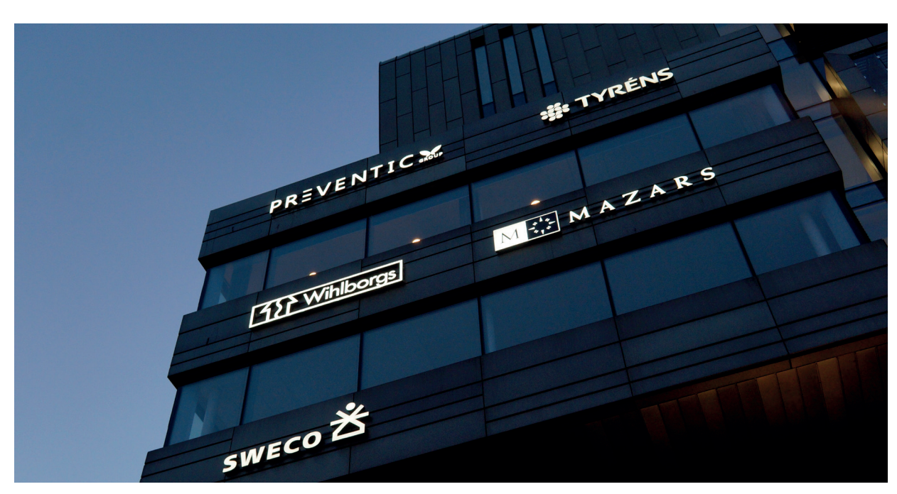
Figure 1: Sign program

More concisely, Bocken, de Pauw, Bakker, and van der Grinten (2016) put forward three ways to move from a linear to a circular economy: slowing, closing, and narrowing resource loops; a triad to which Geissdoerfer, Morioka, de Carvalho, and Evans (2018) add intensifying and dematerializing. Further, Urbinati, Chiaroni, and Chiesa (2017) argue that only firms that combine an internal approach upon production processes with an external approach to one's customers, where both incorporate principles of circular economy, can be fully circular. Moreover, research on CBMs has identified several impediments to circular value creation; from organizational and market-based barriers as well as cultural barriers (Kirchherr et al., 2018) to CBM implementation (Vermunt, Negro, Verweij, Kuppens, & Hekkert, 2019), to unclear waste and environmental effects (Corvellec & Stål, 2017) inadequate regulation (Kirchherr, Reike, & Hekkert, 2017), increased business risk (Linder & Williander, 2017), and corporations paying lip service to the notion (Stål & Corvellec, 2018). In particular, many CBMs come with a claim to deliver superior environmental value – whatever the difficulties to assess such a value (Manninen et al., 2018). On this account, CBMs are a sub-category of business models for sustainability (Wells, 2013) and many CBMs borrow traits from these models, for example, a com-