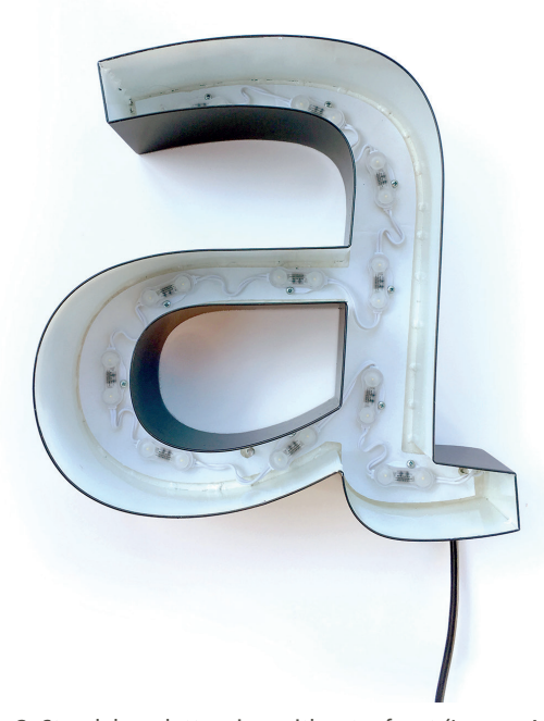
Figure 2: Standalone letter sign without a front

The recycling company explains that screws and aluminum which are taken out mechanically during disassembly can be recovered to produce, for example, casted aluminum products; the metals in the cables can also be recovered; but the rest is to be incinerated for energy recovery. Theoretically, the acrylic front and the polycarbonate fastener could be recovered, but the mechanical process cannot handle these materials and manual dismantling entails too high labor costs. The LED-lamps (see Figure 2) also fail the test of economic viability. They do contain valuable metals, but in too low quantities, for example: one billion LED chips amount to 17-25 kg of Gallium, but only 18 g of Indium; LED-lamps can therefore only be partly recovered through disintegration.