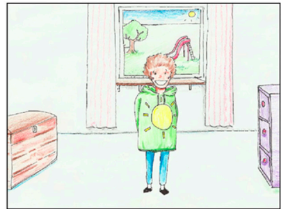
Experimenter asks – non-shared context