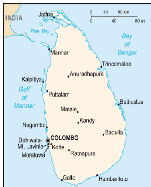
Figure 1: Map over Sri Lanka 101

This chapter is a short introduction the history of Sri Lanka. The focus is on Muslim history and some political movements that are relevant in the years of 1989-1992, but I will start with some important political events throughout the history of Sri Lanka. In the following chapters many cities will be mentioned so I will include a map in this part: