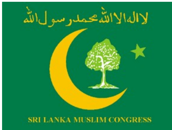
Figure 2: The party flag 145

The first chapter of SLMC's constitution shows no antagonism between nationalism and Islamism. It seems clear that this is an Islamist party with guidelines from the Koran. The second chapter contains the objectives of the party and says that SLMC's duty is to foster and to safeguard the unity, sovereignty and territorial integrity of Sri Lanka. 146 To safeguard Sri Lanka there are other principles that the party and its members should live up to, namely: