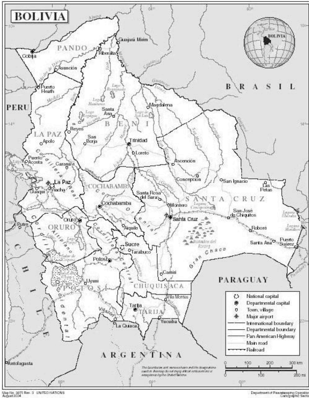
Figure 1: Map of Bolivia (United Nations 2004).