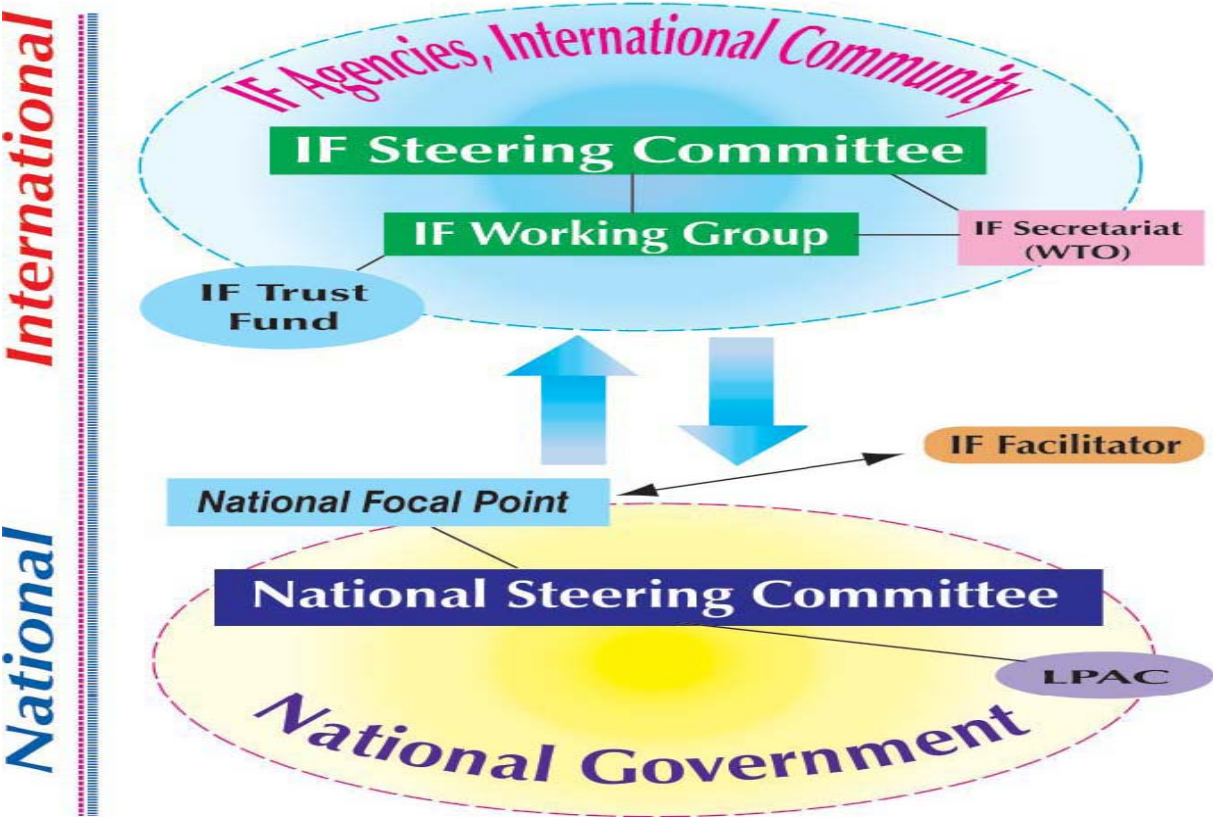
Figure 2: The Integrated Framework Structure