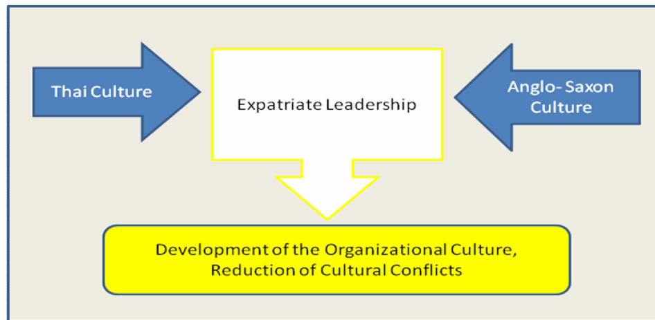
Figure 5.1 Development of an Organization's culture

We realize that Thai culture, to some extent, is ambiguous not only for foreigners but also for Thais who are from different regions because Thailand is largely diversified with a great variety of ethnics, regional cultures, languages, beliefs and values. Therefore, our findings might not be applicable in other cases, even with Anglo-Saxon based companies which are located in other parts of the country.