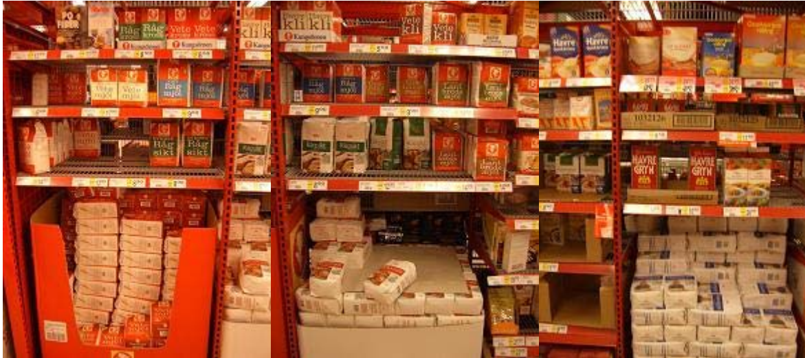
Figure 4. Flour ICA