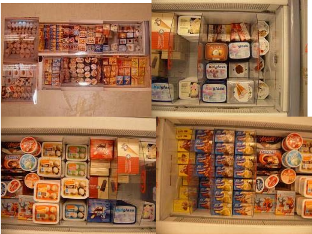
Figure 2. Ice cream ICA