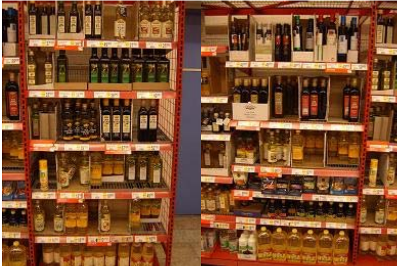
Figure 7. Oil ICA