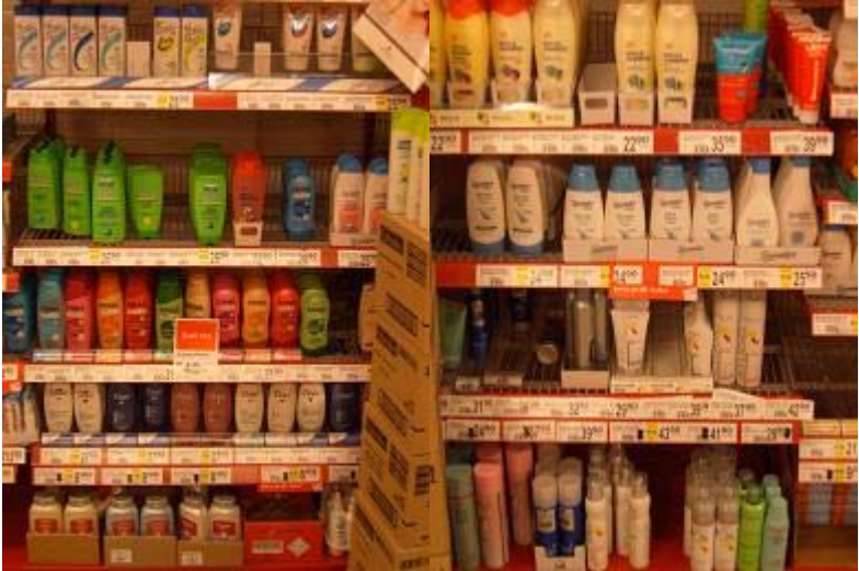
Figure 3. Shampoo ICA