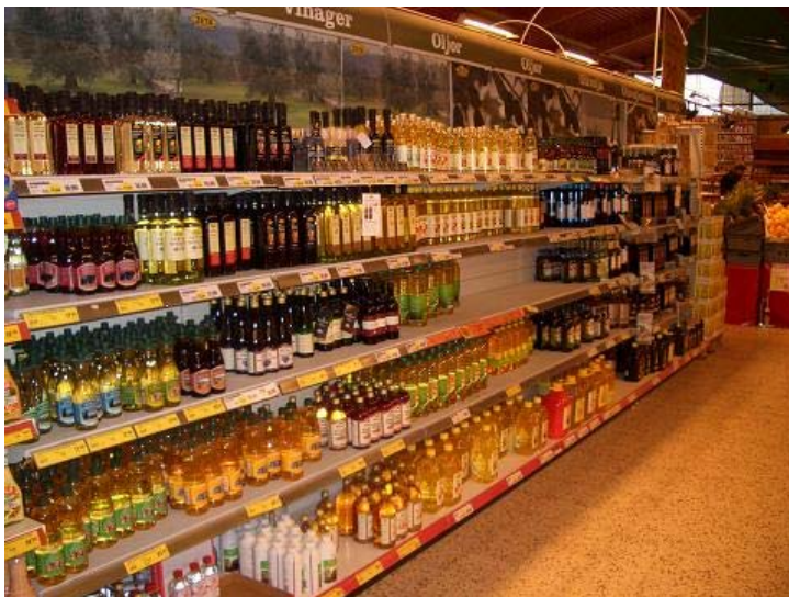
Figure 8. Oil AG's