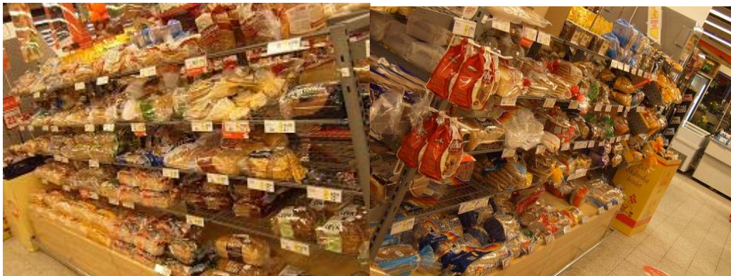
Figure 6. Bread ICA