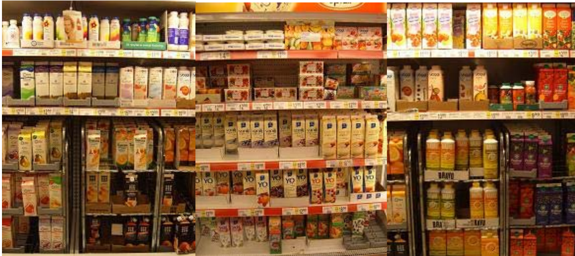
Figure 5. Yogurt ICA