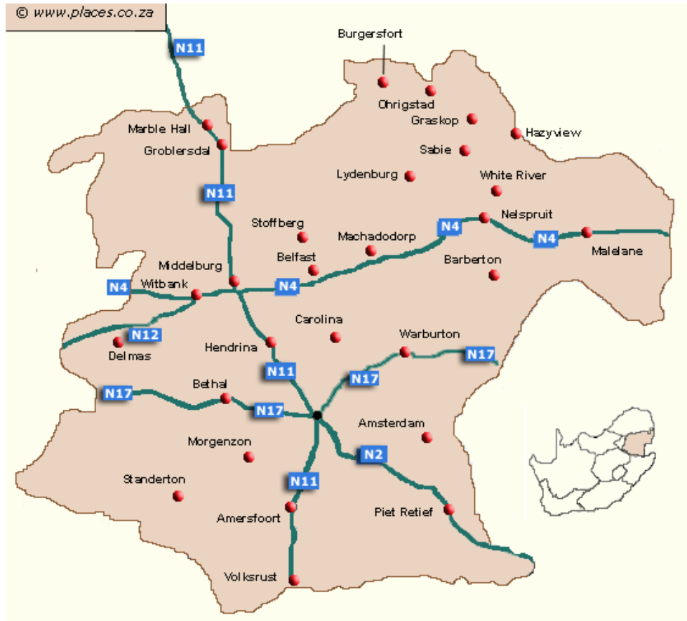
Map of Mpumalanga province