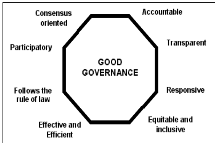
Figure 1: Good Governance, UNESCAP, 2011