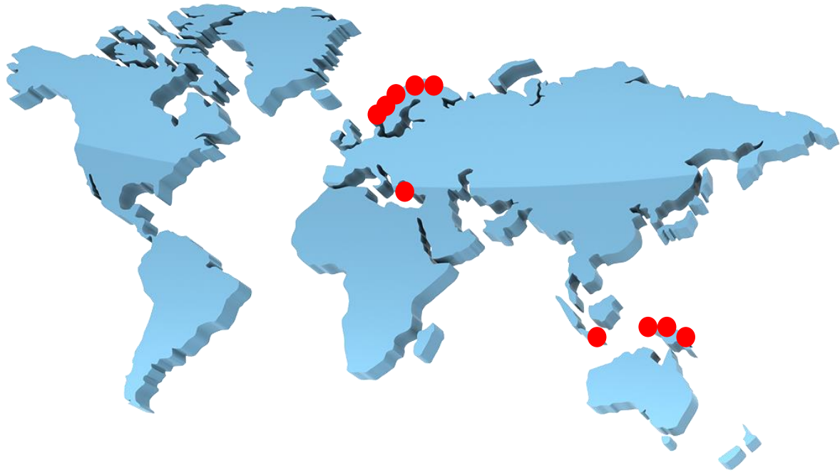
Figure 1. Global STD locations.