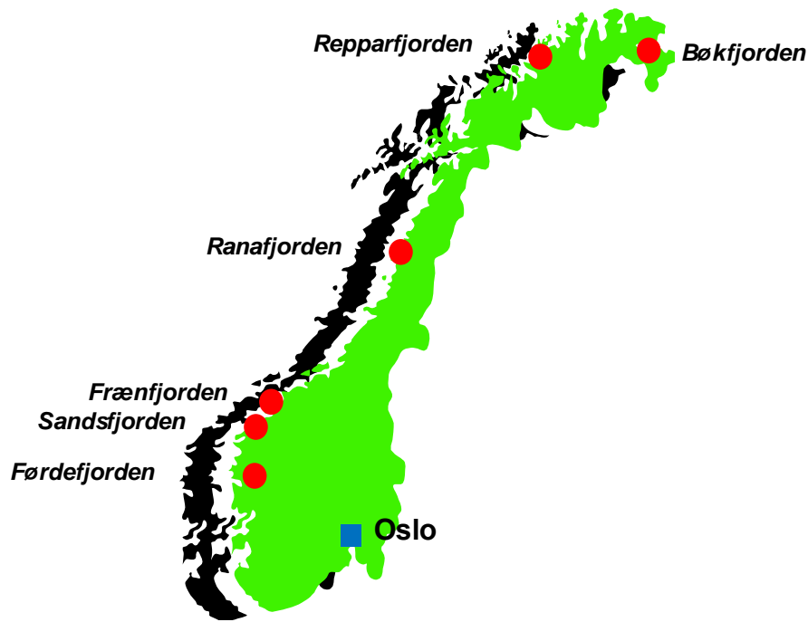
Figure 5. Locations of Norwegian STD operations discussed here.