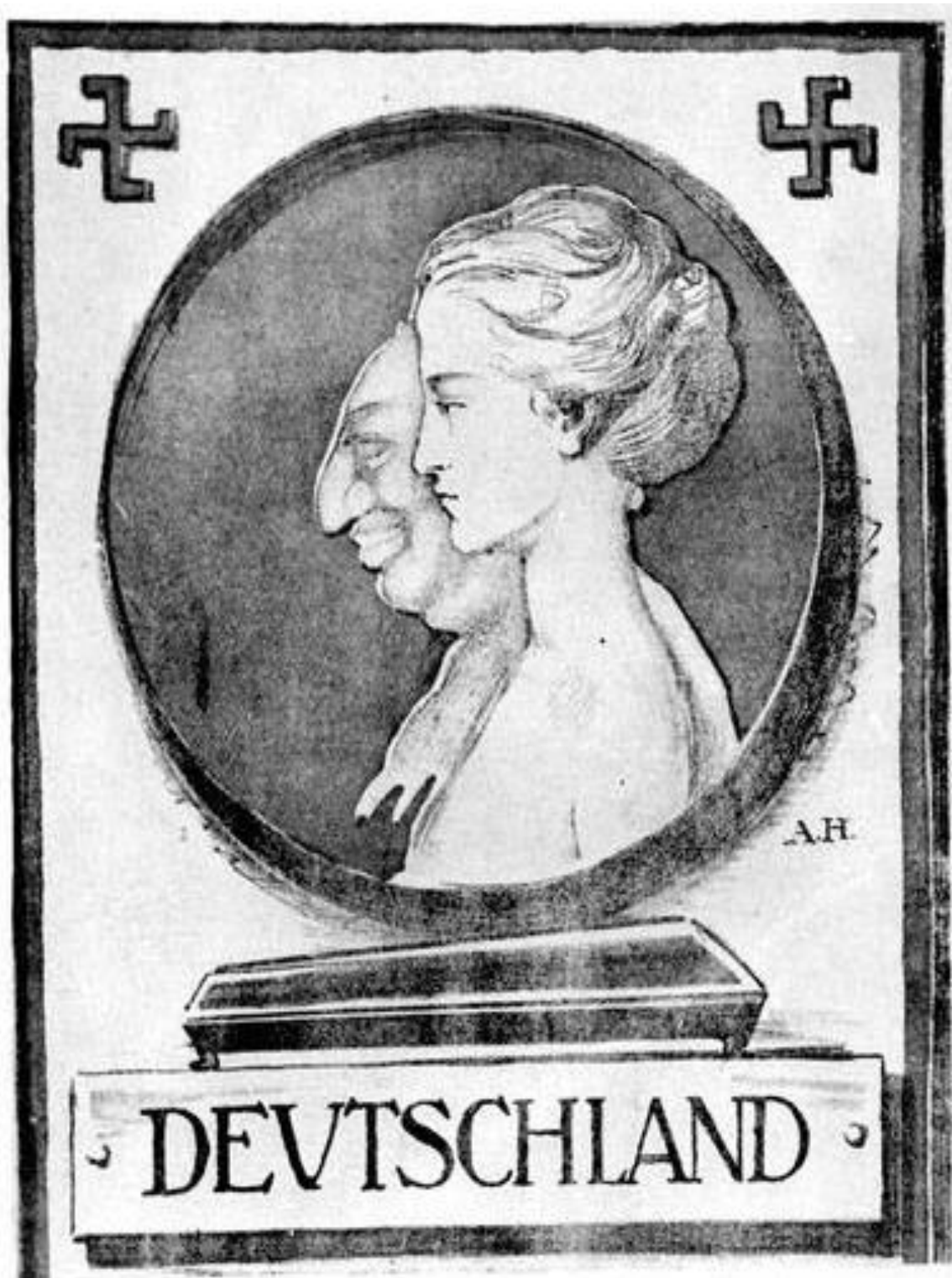
82. Antisemitisches Wahlplakat zur Reichstagswahl. 1920