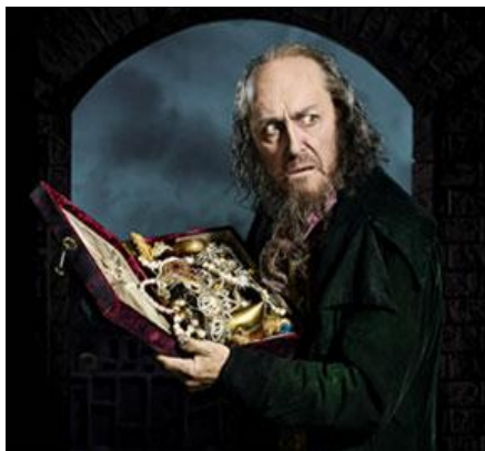
Fig. 3- Griff Rhys Jones as “Fagin”.