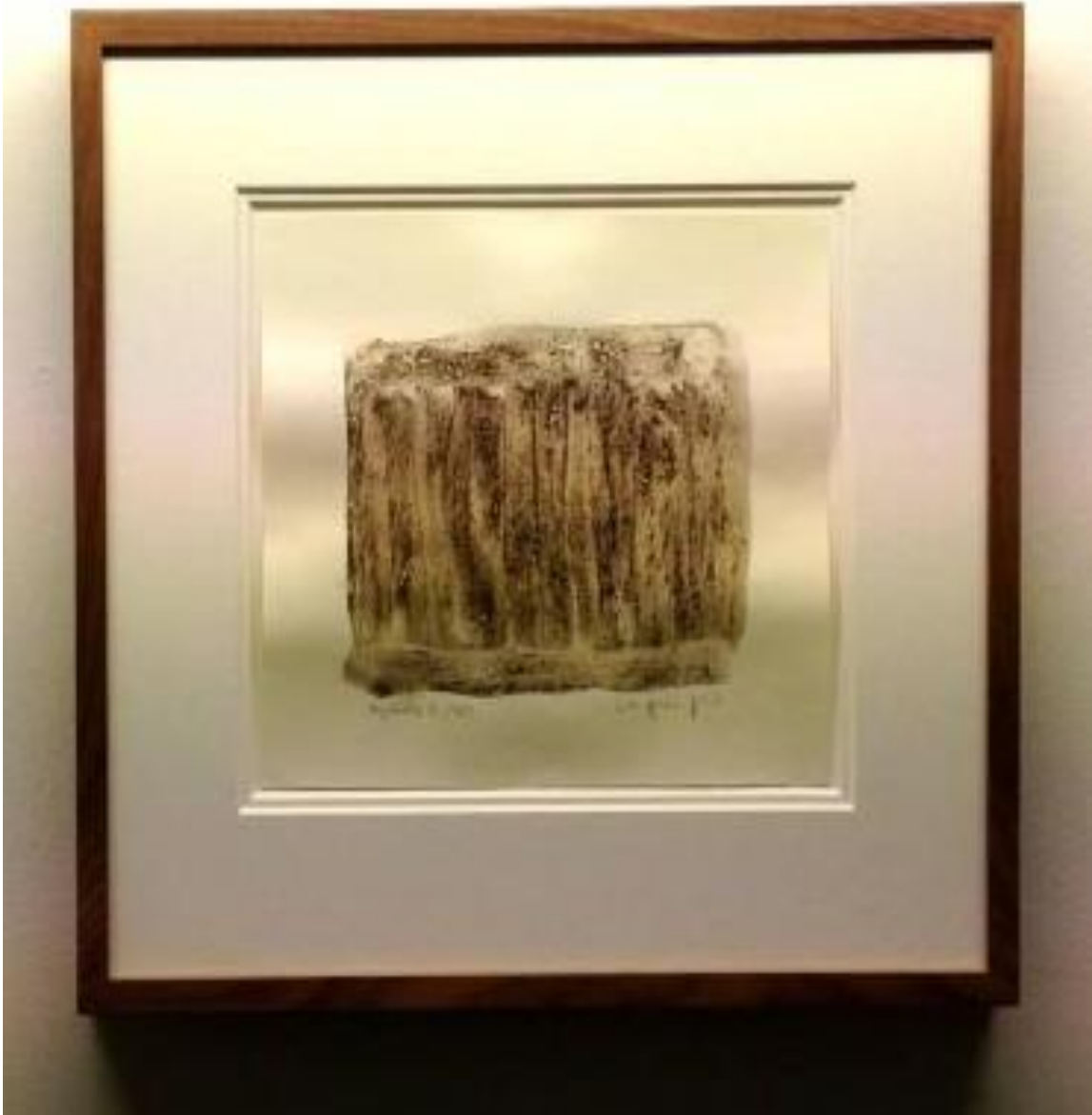
Fig.7- One of the “Majdanek (1989) I-IX” in the “Memory Works” Exhibit by Carl Michael von Hausswolff.