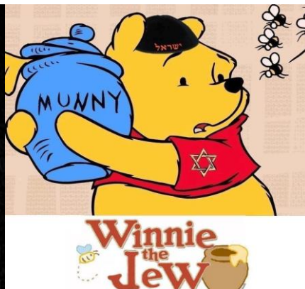
Fig. 4- “Winnie the Jew”.