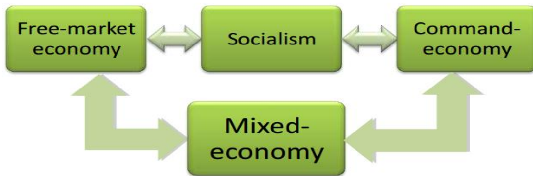
Figure 4. Four Basic Economic Systems

from high authority. Socialism is between former two economic systems. In this system, individuals own private property and could choose their preference independently in, but government still has power to decide various directives toward market. The last one mixed economy is a system includes both private and government control. It contains all characteristics of capitalism and socialism. (Regenesys, 2013)