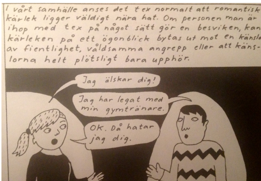
Figure 3. By Liv Strömquist (2010) 6

Feminist literature has both built upon and critiqued aspects of Giddens’ “pure relationship” theory (1992). Popular Swedish feminist graphic novelist Liv Strömquist utilizes and builds upon theories of individualization, modern relationship structure and feminist theory to present (but does not explicitly give ways to resolve) a situation in which today’s individualistic, fragile monogamous relationships are inherently connected with sexual ownership and control under the guise of romantic love (Strömquist 2010).