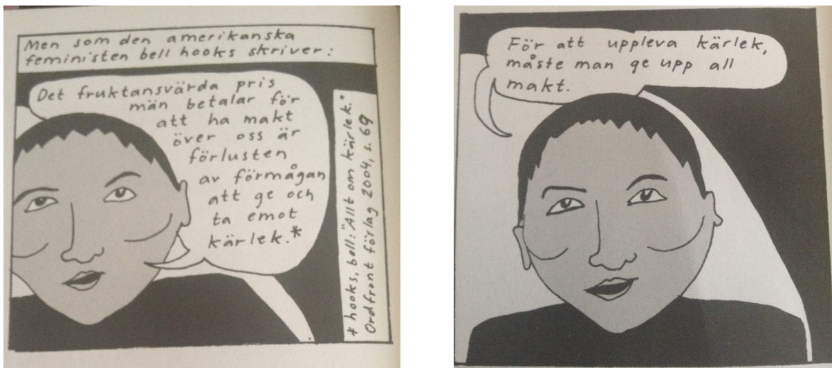
Figure 5. By Liv Strömquist (2010) 8

Strömquist contrasts the seemingly false, ego-based needs which she believes drive many modern relationships with the ability to experience the generous giving and receiving of “real” love which, according to feminist theorist Bell Hooks, requires compassionate lovers who give up all notions of power, control and egoism (ibid). Bell Hooks (1999) ties the unequal power of relationships to patriarchal culture in which she believes men are “inclined to see love as something they should receive without expending effort.”