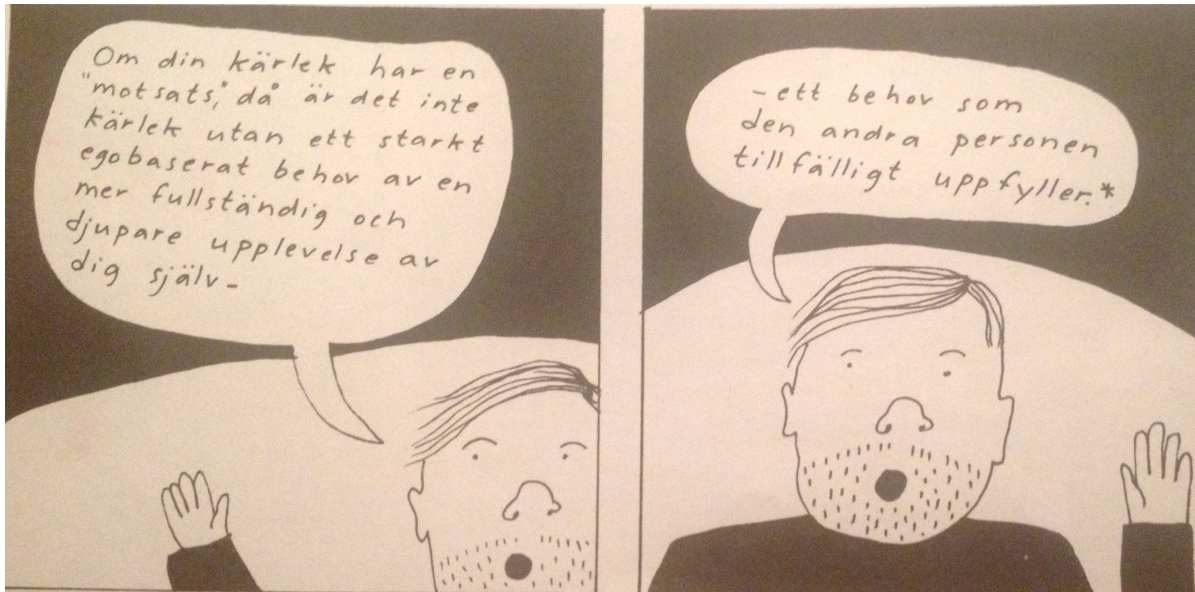
Figure 4. By Liv Strömquist (2010) 7

Strömquist contrasts the seemingly false, ego-based needs which she believes drive many modern relationships with the ability to experience the generous giving and receiving of “real” love which, according to feminist theorist Bell Hooks, requires compassionate lovers who give up all notions of power, control and egoism (ibid). Bell Hooks (1999) ties the unequal power of relationships to patriarchal culture in which she believes men are “inclined to see love as something they should receive without expending effort.”