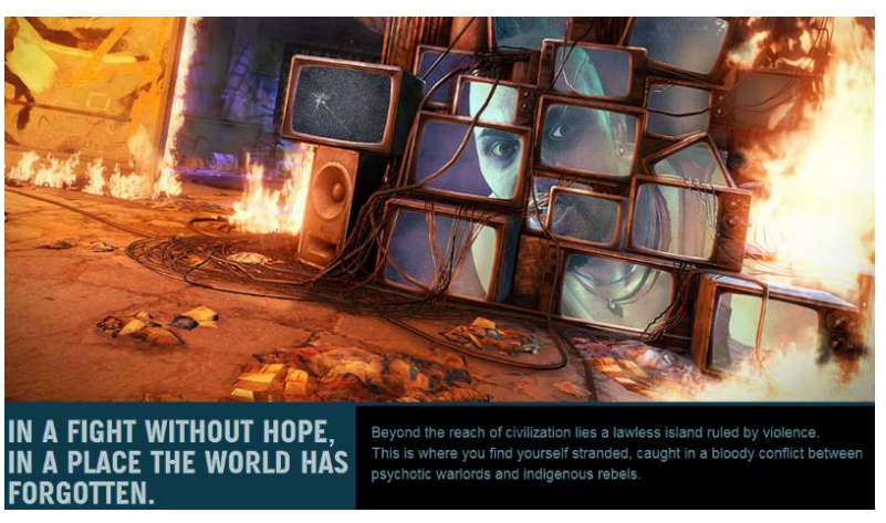
Figure 5 Far Cry Illustration