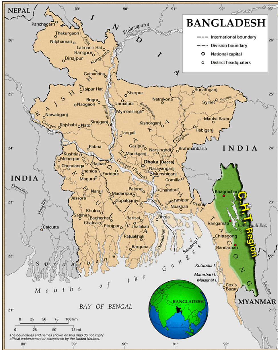
Map:1.3.a. Bangladesh ( http://www.chtdf.org/index.php/about-us/working-location )

contain ethnically disaggregated data "(Roy,R.D.,2012:4).