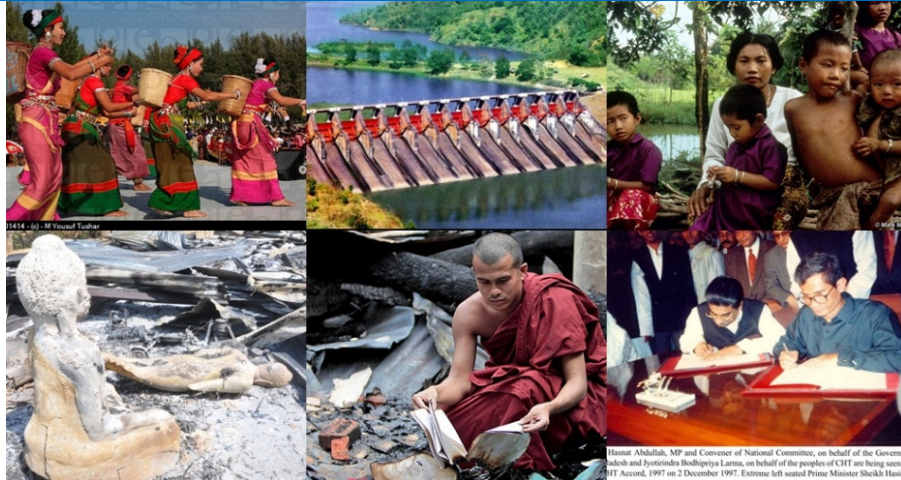
Hasnat Abdullah, MP and Convener of National Committee, on behalf of the Government of Bangladesh and Jyotirmou Bodhisattva Lama, on behalf of the peoples of CHT are being seen at the signing of the Chittagong Hill Tracts Accord, 1997 on 2 December 1997. Extreme left seated Prime Minister Sheikh Hasina