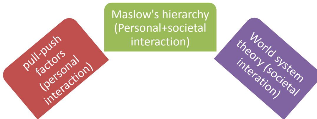
Figure2, Pull-push-Maslow's-World system theory

Source: Model developed by the author, Maslow's hierarchy of needs and world system theory's relationship with individuals and the society.