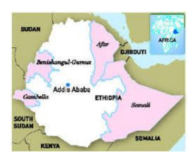
Illustration 1: Areas for villagization Gambella, Afar, Somali and Benishangul-Gumuz (Frontline, 2012)

The official aim of the current state-run villagization program is to improve living conditions for rural populations (HRW, 2012a). The program involves bringing basic infrastructure, socio-economic and cultural transformation into newly constructed villages. Resources will be provided that ensures an appropriate transition to secure livelihoods. Such development projects usually involve financial support from organizations like The World Bank, as it is believed to be a strategy that can improve locals' livelihood (Ambaye, 2013). In order to benefit from the developments, communities need to relocate to the new villages. The state claims that moving is optional. So far, the program has been applied in four regions; Gambella, Afar, Somali and Benishangul-Gumuz (HRW, 2012a). The map below illustrates the geographical placement of those regions in Ethiopia.