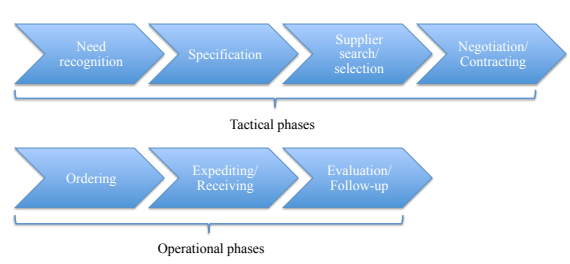
Figure 2: Adapted buying process

The retail buying process is explained by Johansson (2001, pp. 333) as "the set of activities that have to be performed to move a product from the manufacturer to the consumer". In the study the retail buying process is inspired by the industrial purchasing process by van Weele (2010) and the retail buying process by Varley (2001), see Figure 2. The retail buying process consists of tactical phases and operational phases (van Weele, 2010).