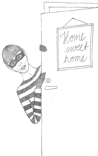
Figure 1: A situation where the detection of the opening of the door is important.

In home security it is important to determine if a door or window is open or closed, as an opening when the alarm is activated might indicate an attempted burglary, like the one in figure 1. Some sort of sensor to be placed on the door or window for this detection is required. Today a magnetic contact is often used. However, to provide options that could increase power efficiency, decrease cost or simplify the installation, an alternative component has been investigated.