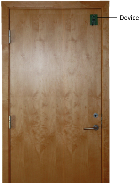
Figure 3: A door with the device used for testing attached.

lems: Firstly, errors will cause the calculated angles to drift. Secondly, the noise levels of the accelerometer will hide very low accelerations. During a burglary the burglar might try to escape notice by opening the door utterly slowly. Therefore some kind of verification of the angle is needed to counteract the drift and detect slow openings. One good option for this is to include a magnetometer.