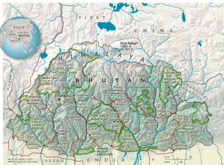
Figure 1: Map of Bhutan

Since 1907 Bhutan has been ruled by a lineage of monarchs in the Wangchuk family, and has never been colonized by an outside power. The traditional structure of Bhutan is monarchical (Kolig, Angeles & Wong, 2009:59). Until 1959 Bhutan was a state of voluntary isolation relying on subsistence agriculture. At this time Bhutan did not have a centralized government administration, average life expectancy was 33 years, modes of transportation were mules, yaks and horses, and the entire nation was rural with no paved roads, no postal service, no village schools, no hospitals, no airports and no currency (Crossette, 1995:10). A point of modernization took place in 1959 when Bhutan's Third King Jigme Dorji Wangchuck created