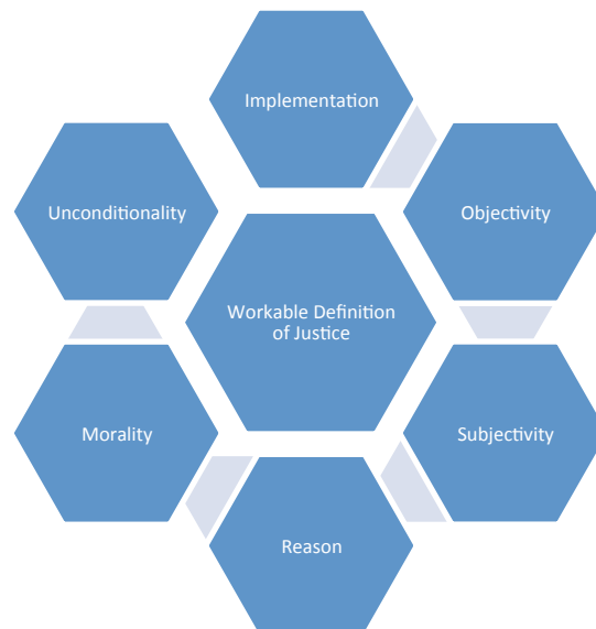
Fig. 2 – The starting point construction of a workable theory for justice

In Figure 2 above, I submit my construction of what would be required from an ideal theory of justice. Aware that the components are in part self-