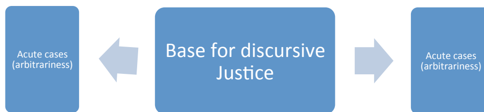
Fig. 3 – When justice values become arbitrary

To problematise, because the model of international law to which we subscribe globally favours the State as the arbiter of justice for its citizens, and therefore ideology must be reduced to State ideology, the ‘acute’ cases of arbitrariness as elucidated by Sunstein, actually become a control mechanism for governments to promote a particularistic view of justice, in the advancement of ideology that suits, not the values of the citizens found on a territory but the values of the authorities in control of a country. 162 Cohen describes this as the idea that ‘basic human rights flow from the responsibility of officials to care for the common good’, 163 as an observational criticism of the human rights regime to which we currently subscribe.