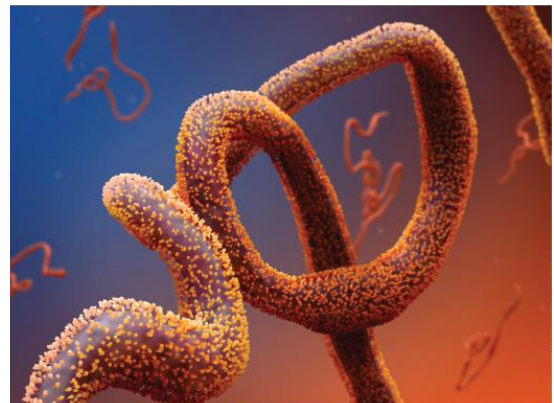
Figure 1.1: Ebola virus seen under microscope Source: Boulton 2014:989

The West African population daily faces several deadly, but preventable, disease outbreaks, such as Malaria, HIV/AIDS and tuberculosis (cf. WHO 2014a). What distinguishes the Ebola virus disease from these is its mysterious and highly fatal character. As of September 2014, the natural reservoir, or the original source of infection, is undetermined; but, fruit bats are thought to be carriers of the virus. The mortality rate is estimated to be between 50-90 percent (Boulton 2014). By comparison, the SARS outbreak in 2003 had a death rate of approximately 9.6 percent (WHO 2004). At present, there is no vaccine or treatment for Ebola. Healthcare workers can therefore only treat the effects of the disease, such as high fever, diarrhea and pain (Boulton 2014; Hewlett & Hewlett 2008:3).