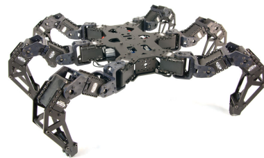
Figure 1: The PhantomX Hexapod Mark II is the platform used in this project.

of walking in uneven terrain while keeping the main body level.