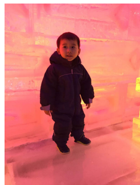
Fig.1. A photo provided by participant 13: her son is wearing the jumpsuits she bought in

There are also some type souvenirs bought in Scandinavia that are meant for their family members. The little boy in picture 1 is the son of participant 13. She came to Scandinavia for a very short business trip. Judging from how she would frequently mention her family and her young child during the interview, I inferred that she must be a very family-oriented wife and mother. She wanted to buy a souvenir for her child and sought inspiration from the kids’ fashion style in Nordic countries. After much thought, she bought a trendily designed jumpsuit for her son in Sweden.