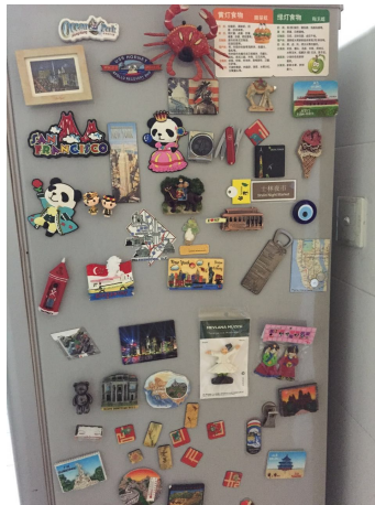
Fig. 3. Provided by participant 13: fridge magnets she bought when traveling.

Fig. 2. Provided by participant 10: (a) fridge magnets she has collected at her travels and (b) the ones she bought from Sweden and Iceland.