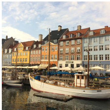
Fig.10. (Left) Nyhavn in Copenhagen, Denmark.

Besides Dala horses in Sweden and Fjords in Norway, the images of the Ice hotel, Nyhavn and the Northern Lights are all successfully advertised and considered as the symbols of Scandinavia according to informants’ reflections and their picked best traveling photos as follows: