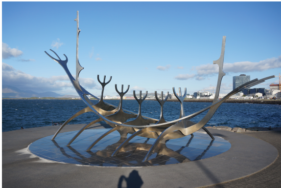
Fig. 5. (Left) A sculpture in Iceland.

Another photo is acting as an even more interesting evidence of the Chinese tourists' searching for the familiarity in Scandinavia.