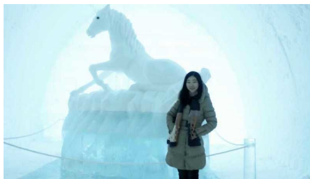
Fig.11. (Right) Provided by participant 15: Ice Hotel in Kiruna, Sweden.

Participant 18 explained the reason of picking this photo as: “the view of Nyhavn is the one I have frequently seen through postcards and social media. Then I finally got there and saw it through my own eyes”. For the photo of Ice hotel, participant 15