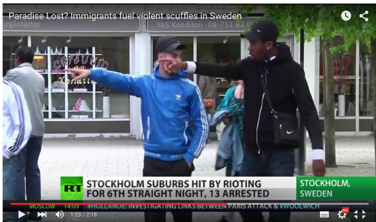
Figure 2. RT broadcast

What should be noted is that none of these youths are interviewed to either confirm or disconfirm the depiction of themselves in the report.