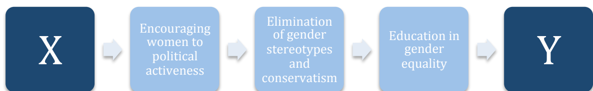
Figure 2: Presenting my testable implications that, if confirmed and proved, are the explanation to how my X, which is the bottom-up approach, explains why women are underrepresented on decision-making levels.

In my case I have a dependent variable, Y, which is the underrepresentation of women on decision-making levels. I am trying to explain why, using an X with the bottom-up approach as a theory with an anthropological feminism perspective. (Teorell & Svensson 2012. p 82, 221) Therefore my explanatory single case study will include a process tracing where the aim is to expose the possible paths to why these implications in my theory have lead to the Y (Teorell & Svensson 2007. p 27).