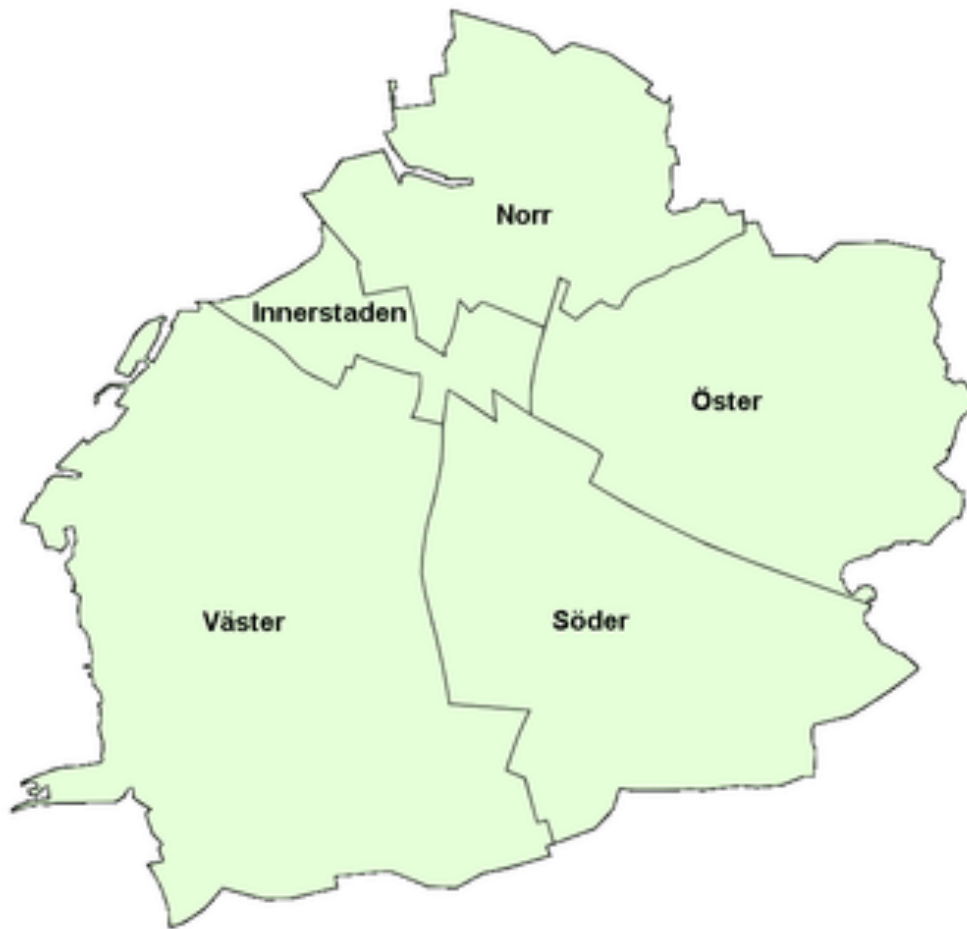
Figure 3: Map of city areas of Malmö