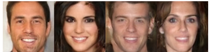
Fig. 2: Images generated using the GAN.

formance of face recognition in a predictable way. In particular these methods could be useful in order to improve performance of face recognition in surveillance camera footage, as captured images can be compared against similarly posed synthetic images. However, the augmentation techniques used are quite complex and run the risk of failing at times, which can reduce recognition performance. Creating more robust augmentation procedures is a key component for future work in this area.