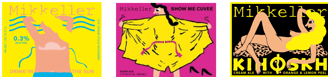
Image 9: Drink'In the Sun, Show Me Cuvee, & Mikkeller x Kihøskh Cream Ale labels