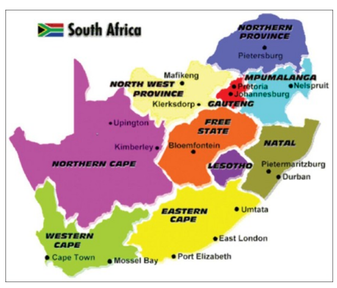
Table 1: Map of South Africa.

Looking at South African history, the Eastern Cape (EC) has come to play an important role for the country's cultural conflicts and the fight for African democracy. It is in this region the first colonial wars were fought and later, the area has been controlled under Afrikaner nationalism (Van den Berghe, 1965). The region thus has a dark history of racial division leading to the birth of the apartheid resistance movement lead by, the EC born, Nelson Mandela. Apartheid has influenced the racial differences and development injustices found in South Africa but especially between races and between the country's Western versus Eastern sides. Although officially dismantling apartheid in the early 1990s the EC still lives with the aftermath of this devastating era (Sahistory, 2011, 2013)