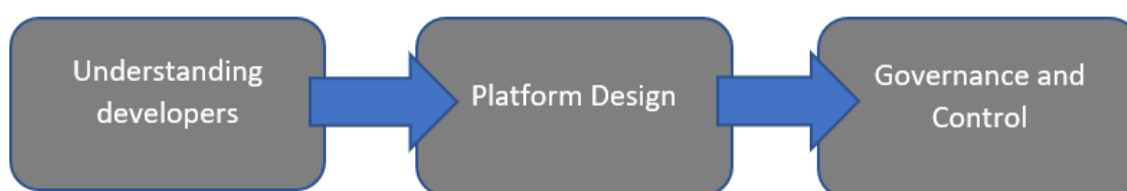
Figure 2.2: A Conceptual model for the process of platform establishment