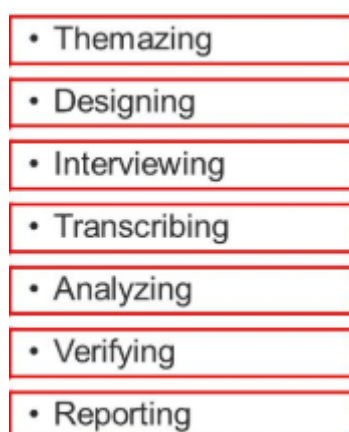
Figure 3.1: Kvale and Brinkmann's (2009) seven stages of interview research

This way we were able to gather data in a less intrusive, but rather a conversational manner that allowed for better clarification and understanding of the subject contexts (Recker, 2013). In this section we implicitly followed Kvale and Brinkmann (2009) seven stages (Figure 3.1) of conducting interview research whereby we first thematized the main concepts from our theoretical review as depicted by the research framework in Table 2.1. Using this, we designed our interview guide (Section 3.2.2) after identifying potential respondents (Section 3.2.1), scheduled and conducted the interviews (Section 3.2.3), transcribed, analysed and reported our findings as seen in section 3.3 and the following chapters.