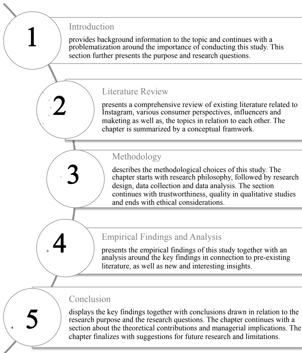
Figure 1-1 Outline of Thesis

The outline of the thesis is displayed in Figure 1.1- Outline of the thesis below where each chapter is described with its overall purpose.