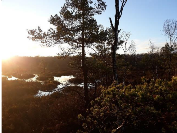
Field site at Ageröds mosse in Scania, Sweden

The undisturbed samples were excavated from three sites in Sweden and the shear wave velocity was also measured at these sites, making a comparison possible. In addition to this, the peat has been characterised by determining to what degree it is decomposed and its water content. The water content is very high for peat which allows for a large consolidation, thus making it important to measure.