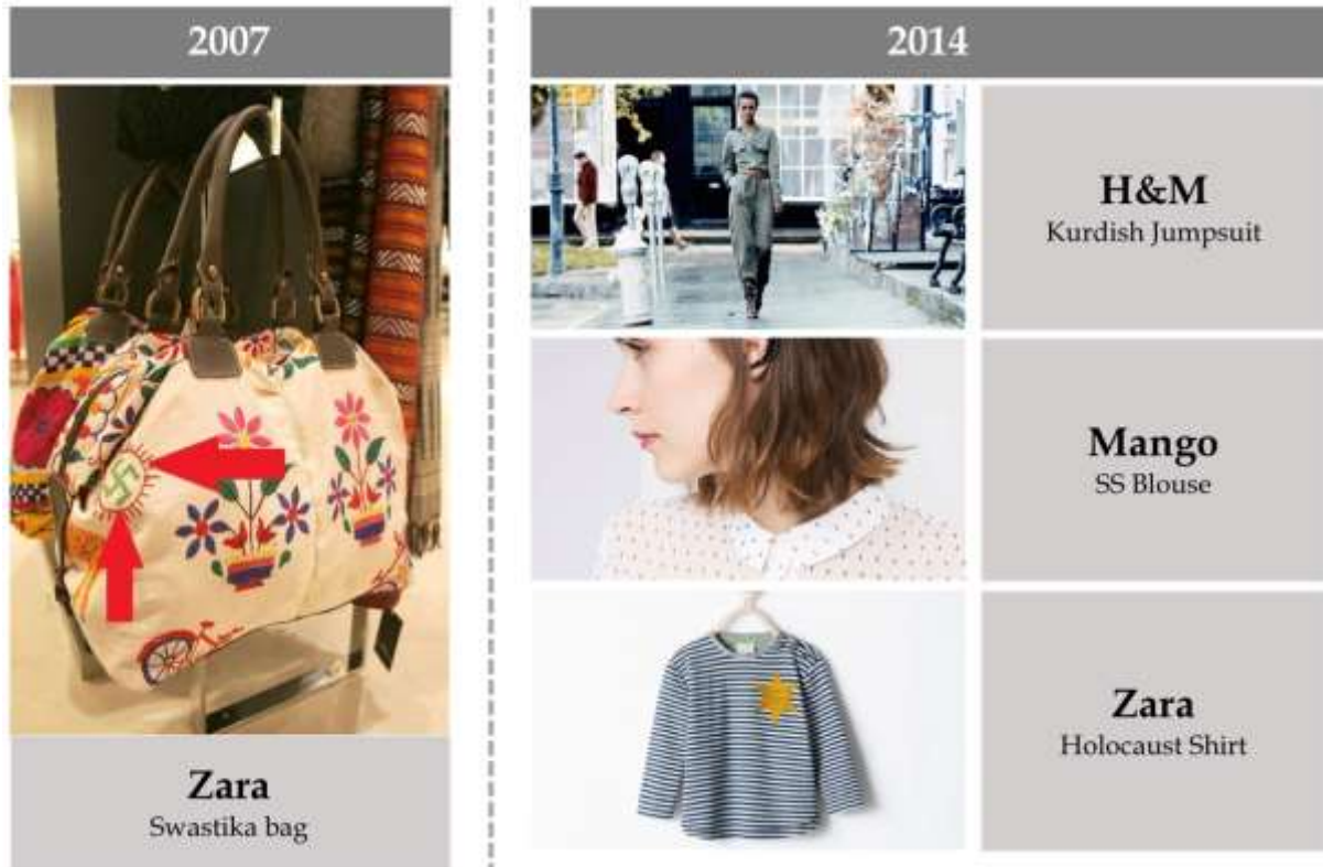
Exhibit 2 Timeline of Incidents