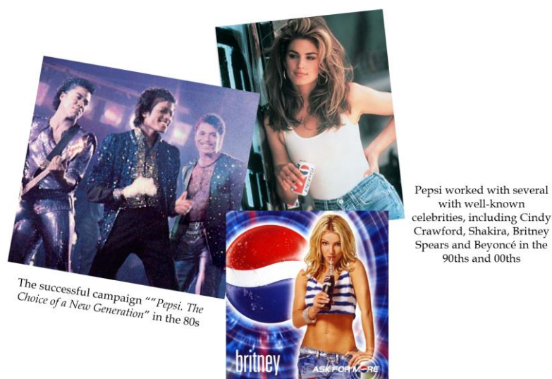
Exhibit 3 - PepsiCo collaboration with celebrities

In 2012, PepsiCo launched its global campaign "Live for now", which is in line with the brand strategy and corresponds with previous campaigns, such as "Pepsi Generation". The campaign aims to inspire people around the globe to live life to the fullest. Throughout the years, the commercials featured well-known celebrities: among others, Nicki Minaj and Beyoncé - exhibit 3 .