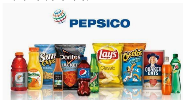
Exhibit 1 - PepsiCo Brand Portfolio 2015.

PepsiCo is a global leader in the food and beverage industry with over $63 billion in net revenue in 2016 and a global portfolio of 22 diverse brands. Some of the top brands, besides Pepsi, are Lipton, Tropicana, Lays and Aquafina - exhibit 1 .