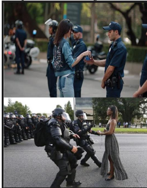
Exhibit 5 - Baton Rouge & PepsiCo similar images