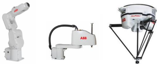
Examples of articulated, SCARA and delta robot.

There are three basic types of robots commonly used in the industry: articulated, Selective Compliance Assembly Robot Arm (SCARA) and delta.