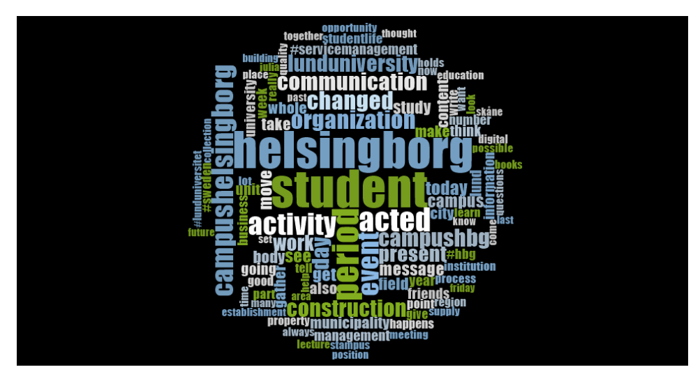
Figure 1. Word Cloud developed by NVivo12.