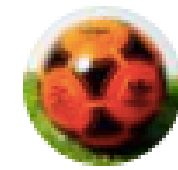
Mat Kendrick ✓ @MatKendrick