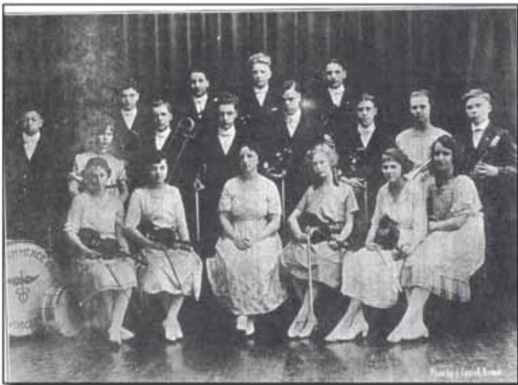
THE HIGH SCHOOL OF COMMERCE ORCHESTRA

There is a picture and some information on this high school orchestra in the 1921 yearbook. 27 The list of musicians does not entirely correspond with the photograph.