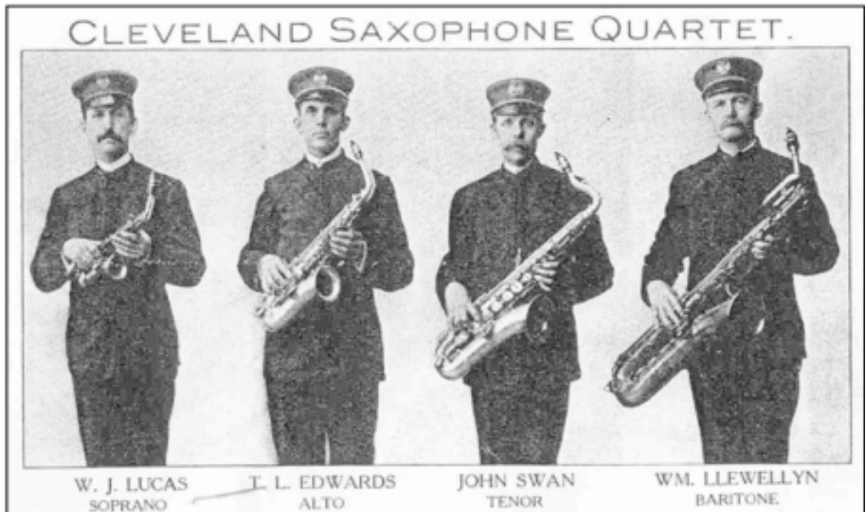
The Cleveland Saxophone Quartet.