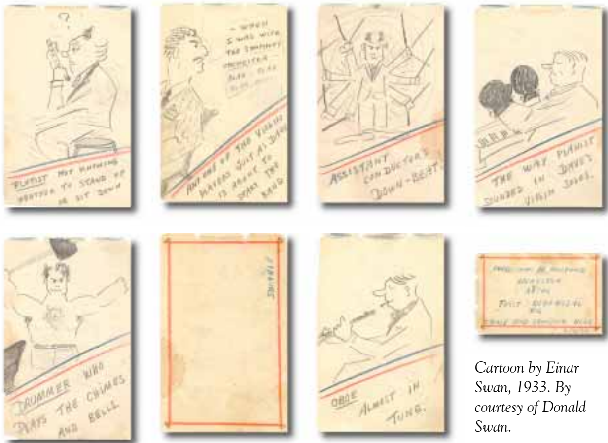
Cartoon by Einar Swan, 1933.