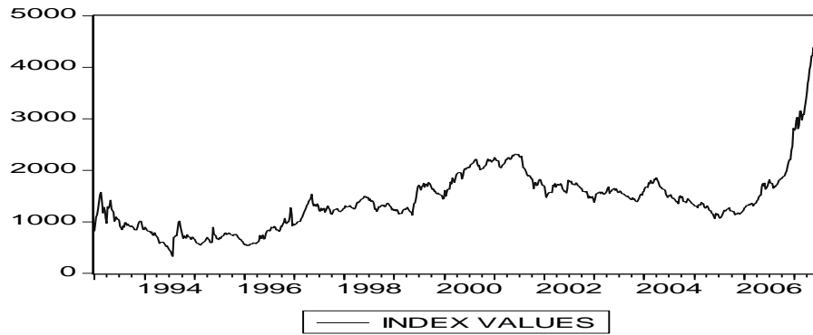
Figure 2: Weekly Shanghai "A" Share Market Performance during Jan 1993 to Jun 2007

For further study, we measured market size by the annually average value of market capitalization and the ratio of market capitalization to Gross Domestic Product (GDP), while annually turnover value and market turnover ratio which is defined as the trading value divided by market capitalization are considered as the indicators of market liquidity. We can see increase in the absolute value of market capitalization after year 2002, but the increase lags behind the national economic development. However the improvement in turnover ratio and ratio of floating market capitalization to total market capitalization implies more liquidity has been led into the market and the positive outcome of state-owned share transformation. (see Table1):