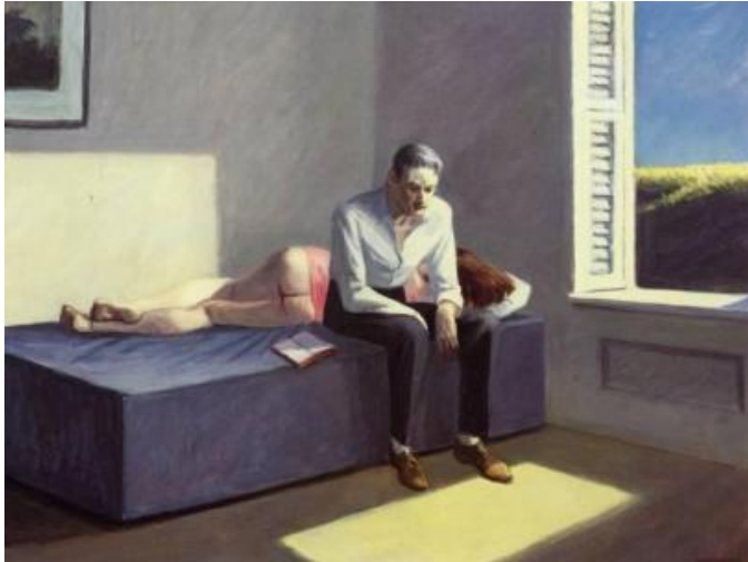
Excursion into Philosophy by Edward Hopper