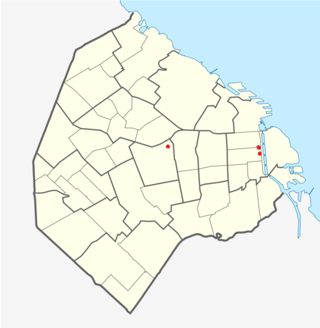
Figure: Red dots indicating installations carried out by the Iresud project in the city of Buenos Aires.

Due to the importance that solar energy is being attributed worldwide as a feasible way of reducing CO 2 emissions and the ecological footprints of cities, the focus of this thesis will be urban sustainable development through the adoption of renewable energies. By analysing the Iresud project in the setting of Buenos Aires I will have a platform for discussing local energy generation as a viable approach for agreeing with a multi-faceted urban sustainable development. These concepts will be discussed in depth in the theoretical section of the thesis.