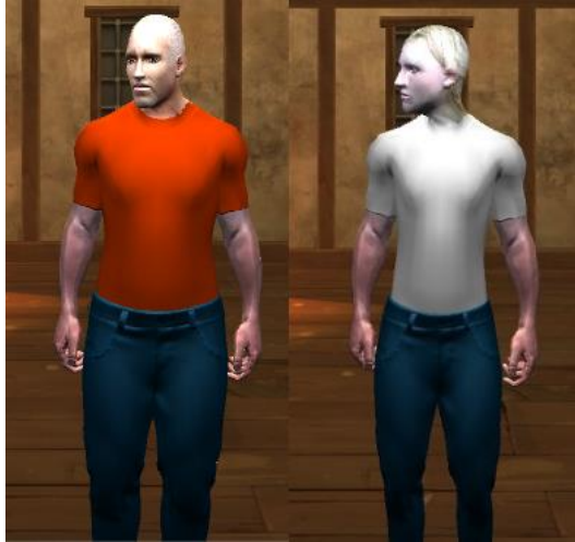
Figure 2 Examples of two generated avatars used in a game.

The results were tested by letting respondents try to match real world faces to their corresponding avatars. 82.7% of the faces were matched correctly. In its current state the algorithm does very little to properly model hair. It does not take the shape of the hair style into account in the final model and thus only use the color of the hair. If the volume of the hair style could be modeled as well, the recognition rate would probably increase drastically. This observation is further supported by the fact that the recognition rate was lower for women than for men, probably due to women more often having hairstyles with more volume. Properly modeling hair is thus the most important future improvement of the algorithm.