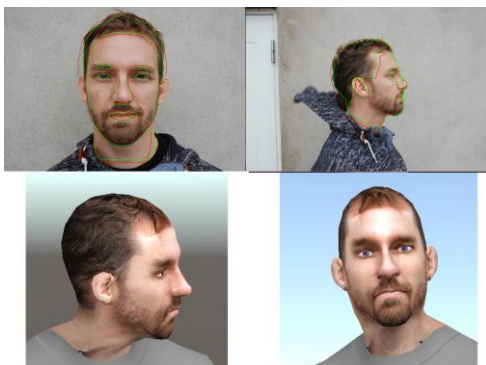
Figure 1 Process overview. Top row: Photos where the algorithm has determined the shape of the face from two views. Bottom row: The resulting avatar.

In computer games player avatar creations become more and more advanced to the point where they are almost able to recreate a real life person, given enough time. Many players seem to spend hours trying to recreate themselves in order to be the hero of the game they are playing. Enter Selfie to Avatar. Rather than spending hours creating an avatar that will remind the player of herself, the Selfie to Avatar system takes two photos of the player and constructs a 3D copy of her.