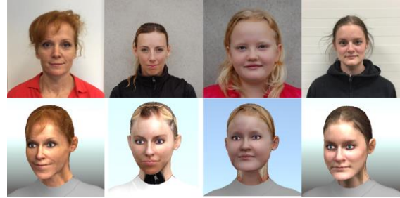
Figure 4 Some examples of female avatars generated by the algorithm. Note how the hair in the avatars lack volume.

Who knows, in the future we may be playing games where we and our friends and family are the characters? Maybe we will even be “hanging out” online in 3D worlds populated by our exact copies? Maybe businesses will be able to operate without offices as the employees can interact in virtual reality represented by their avatars? Regardless of what the future brings the creator of this algorithm hopes to have helped with one step of the way.