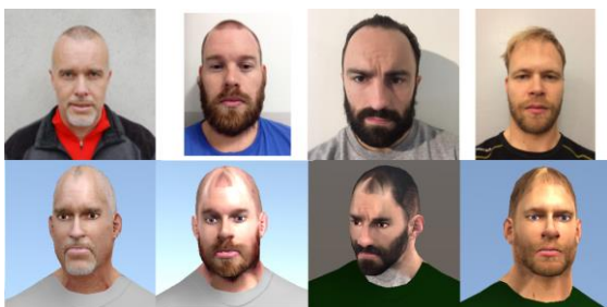
Figure 3 Some examples of male avatars generated by the algorithm.

The results were tested by letting respondents try to match real world faces to their corresponding avatars. 82.7% of the faces were matched correctly. In its current state the algorithm does very little to properly model hair. It does not take the shape of the hair style into account in the final model and thus only use the color of the hair. If the volume of the hair style could be modeled as well, the recognition rate would probably increase drastically. This observation is further supported by the fact that the recognition rate was lower for women than for men, probably due to women more often having hairstyles with more volume. Properly modeling hair is thus the most important future improvement of the algorithm.