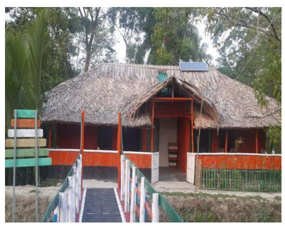
Figure 3:Gol Kanon