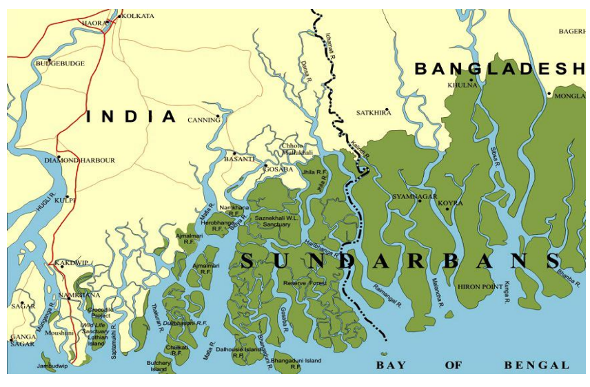
Figure 1: Map of Sundarbans

Known for its natural resources and a wide biodiversity of mangrove flora and fauna, the Sundarbans is a unique ecosystem compromised of densely covered mangrove forests; home to threatened species such as the Royal Bengal Tigers, Irawadi river dolphins and salt-water crocodiles (UNESCO, 2017). In what is known as the world's largest mangrove forest, the area is spread across Bangladesh and India where 60% lies within the Southern Bangladeshi borders and the remaining 40% in India (ibid) (See figure 1). This thesis concerns itself with the Bangladeshi side.