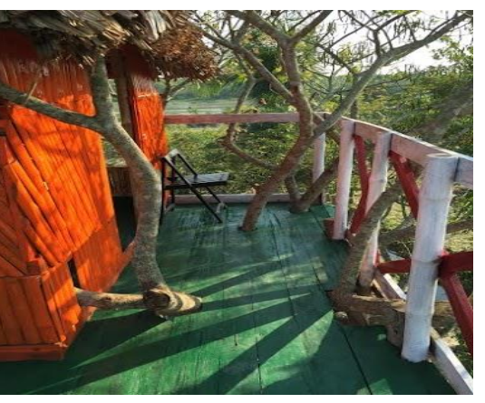
Figure 4:Eco cottage tree house

Named after the Nypa palm tree 'golpata', Gol Kanon's eco-site has two cottages. The cottages are compromised of a bamboo structure with Nypa palm thatched roofing and are equipped with solar lamps, solar batteries and solar fans to cool down the interior for those humid months (Relief International, 2017a). This fulfills part of the criteria of ' low impact construction ' in the environmental sustainability goals of ecotourism. Through using the abundant and traditional Golpata plant as thatching for the roof, as well as bamboo in the interior, the construction blends in with the environment. Thus the ' proactive use of available local building materials and natural resources ' also a criterion in the economic sustainability goals of ecotourism is achieved. Using what is locally available and cutting down on costs rather than resorting to exported resources. The second eco-site Mangrove Eco Cottage & Tree House is situated in the Khulna district. It has two cottages constructed with the same