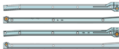
Figure 1. A roller slide set consisting of four slides.

In an early stage of the study, it was concluded that designing a completely new solution would be too expensive and the focus was therefore placed upon adjusting the current design. To investigate which changes of the design that improved the perceived quality, simplified prototypes representing a number of modifications of interest were manufactured at the IKEA prototype workshop.