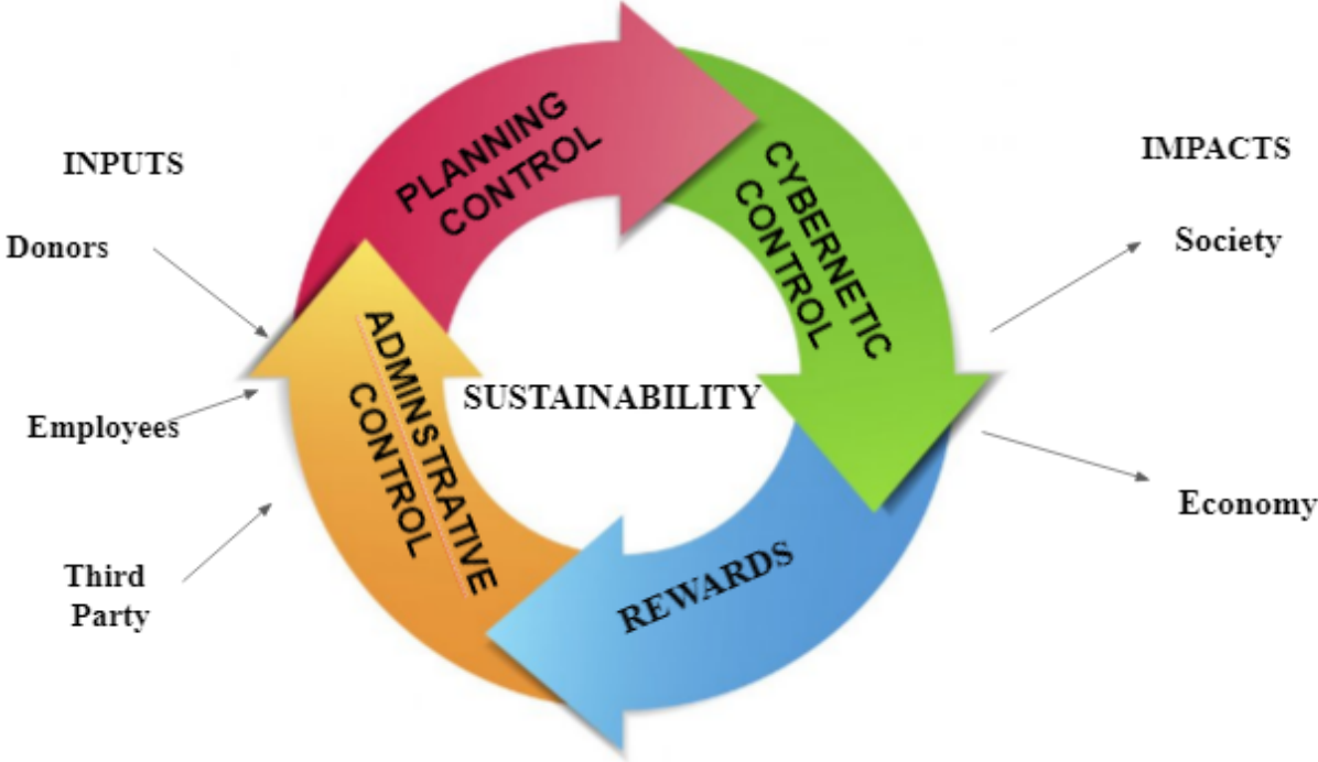
Exhibit 2 Model of Sustainability using MCSs.

Based on our empirical findings we designed a model which highlights how sustainability can be achieved with the use of the MCSs while providing detailed explanation of the various factors and actors in the subsequent section. For an organization to be able to promote sustainability and sustainable development we assume the management control system can be used for successful integration with the collaboration of its employees, donors and partners, regulators, government and the communities for realisation of its objectives.