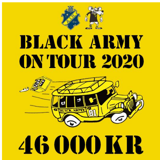
Picture 1. From Black Army's official Facebook page (retrieved April 2021).

The virtual bus trips were an example of a simple engagement that supporters could do, and with a small amount of money, they could support the club, and see their strength and meaning rising with every crown collected. During the 'normal' year, away matches can be exhausting. Sweden is a relatively big country, with hours of driving between towns. Matches are often on week days, especially Mondays, which makes it problematic with work arrangements. The virtual bus was a substitute for some, but a unique opportunity for others. It also showed how small contributions could turn into substantial help. But AIK turned out to be in dire need for more help, both moral and monetary, which prompted a bigger action.