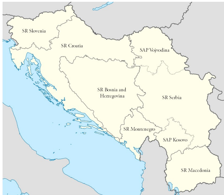
Figure 1: Map of the Socialist Federal Republic of Yugoslavia (1946-1990), with constituent Socialist Republics (SR) and Socialist Autonomous Provinces (SAP).

Used under Creative Commons license CC-BY-SA-3.0-DE ( https://creativecommons.org/licenses/by-sa/3.0/de/legalcode). The original image has been modified only to include the labels on the countries and regions relevant.